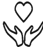
Service (hands that share)