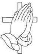
Faith (hearts in prayer)